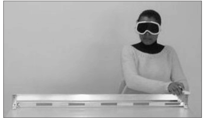
Figure 1. Photo of an individual, wearing opaque goggles, and the linear positioning apparatus.

Participants were assigned to either the self-control or yoked groups in a quasi-random order. Specifically, they were assigned to groups based on the chronological order of their appointment for participation, but were yoked male-to-male and female-to-female, with 7 men and 8 women in each group. Participants were informed about the goal of the task in simple language. They were asked to sit in a comfortable